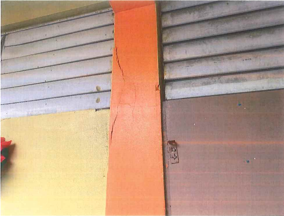
Foto 5: Grieta preexistente en el empañetado de columna del comedor la cual fue causada por penetración de clavos en la esquina de esta.