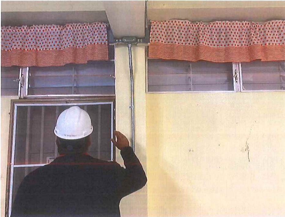
Foto 6: Interior de la columna que en el exterior tiene la grieta preexistente por penetración de clavo donde no se observa ningún daño estructural.