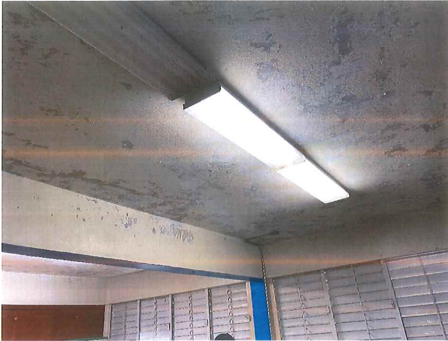
Foto 3: Problemas de filtraciones en los techos del plantel escolar.