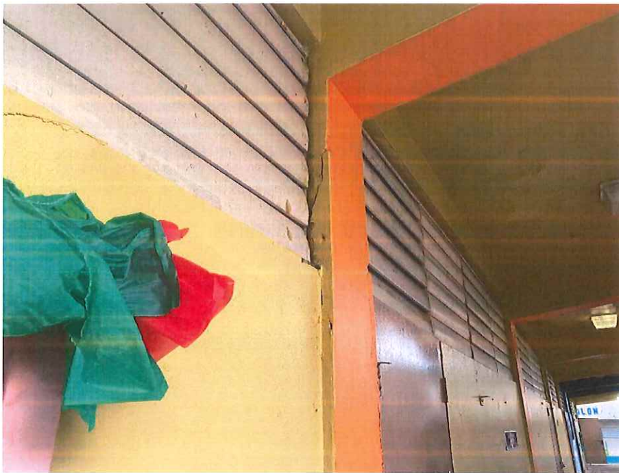
Foto 5: Grieta preexistente en el empañetado de columna del comedor la cual fue causada por penetración de clavos en la esquina de esta.