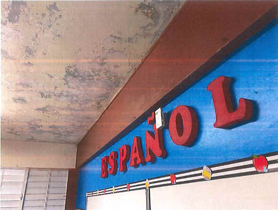
Foto 4: Problemas de filtraciones en los techos del plantel escolar.